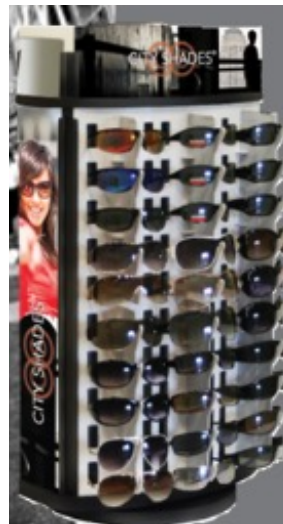
60 Count Spinning Counter Rack