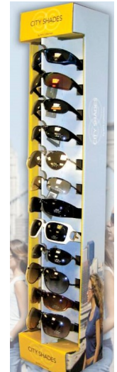
12 Count Classic Counter Display