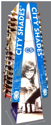
72 Count Corrugated Floor Display