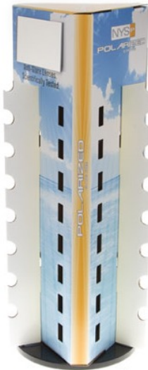
24 Count Polarized Counter Display